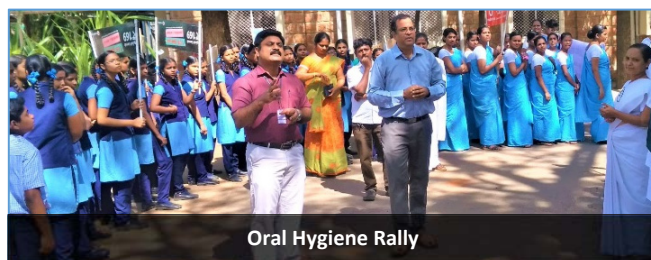
Oral Hygiene Rally

Survey on the socioeconomic status of our patients revealed that 65% of our patients are from the upper lower class. To meet the needs of the people from the lower class we need to have more village clinics.