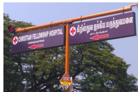
New sign board in front of the hospital